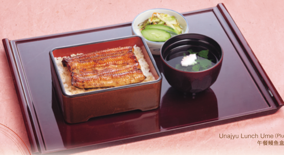
Unajyu Lunch Ume (Plum: Small) 午餐鳗鱼盒饭 梅(小)