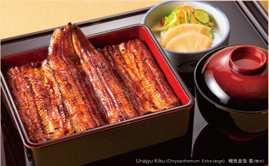
Unajyu Kiku (Chrysanthemum: Extra-large) 鳗鱼盒饭 菊(特大)