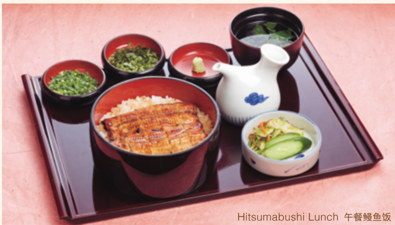
Hitsumabushi Lunch 午餐鳗鱼饭