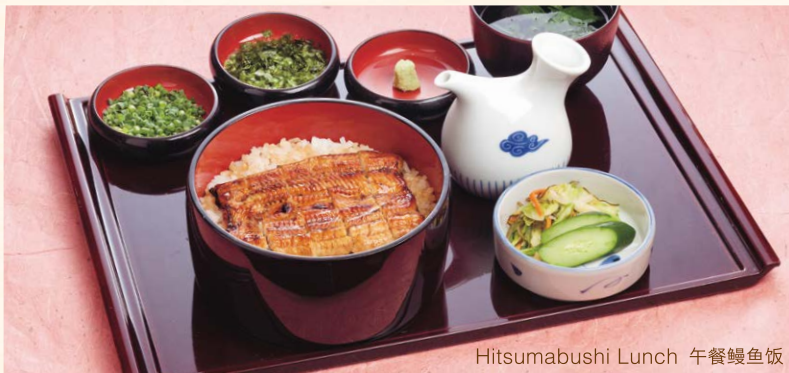
Hitsumabushi Lunch 午餐鳗鱼饭

*The shapes of the eel pieces may be different in each dish and on different days, but the same dishes by name will have the same amounts of eel.