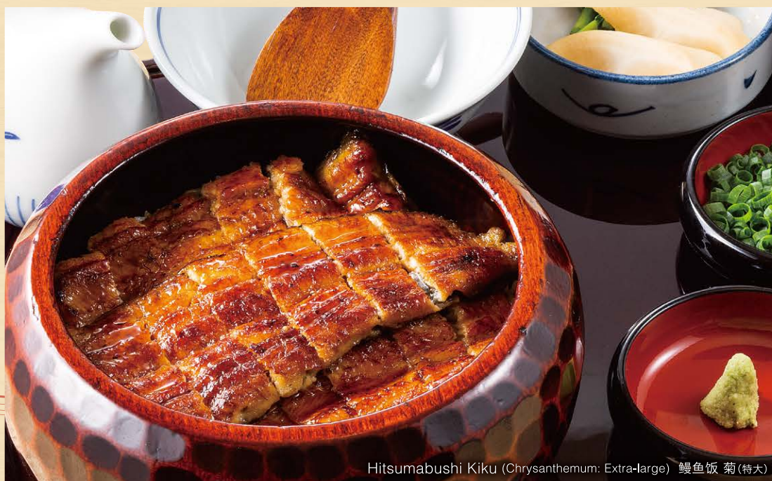
Hitsumabushi Kiku (Chrysanthemum: Extra-large) 鳗鱼饭 菊(特大)