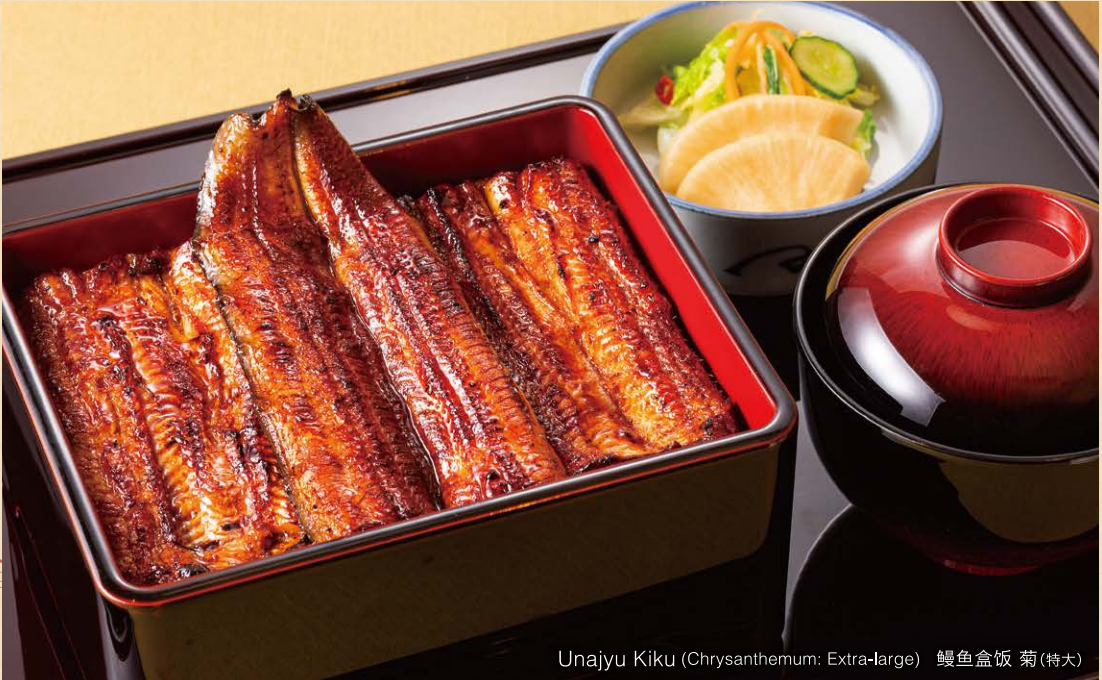
Unajyu Kiku (Chrysanthemum: Extra-large) 鳗鱼盒饭 菊(特大)