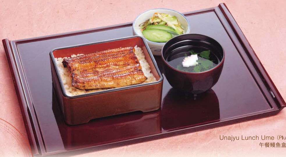
Unajyu Lunch Ume (Plum: Small) 午餐鳗鱼盒饭 梅(小)