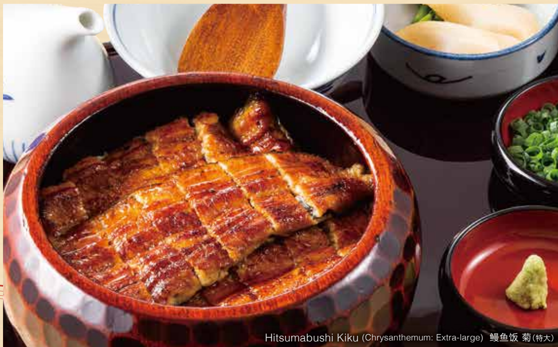
Hitsumabushi Kiku (Chrysanthemum: Extra-large) 鳗鱼饭 菊 (特大)