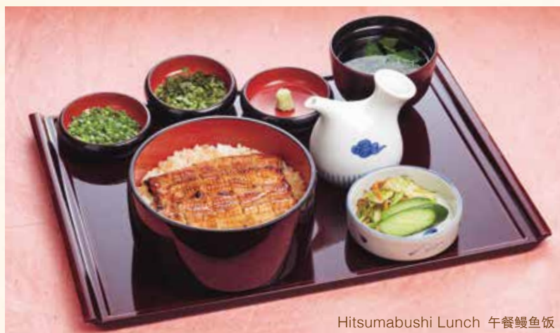
Hitsumabushi Lunch 午餐鳗鱼饭

*The shapes of the eel pieces may be different in each dish and on different days, but the same dishes by name will have the same amounts of eel. *Wheat is included in the Unajyu Lunch and Hitsumabushi Lunch ingredients. *Upgrade your soup to our eel-liver soup for an extra 200 yen. ※根据进货情况, 鳗鱼的形状或有不同, 但分量不会改变。 ※午餐鳗鱼盒饭、午餐鳗鱼饭的部分原材料含有小麦成分。 ※加200日元可变为鳗鱼肝汤。