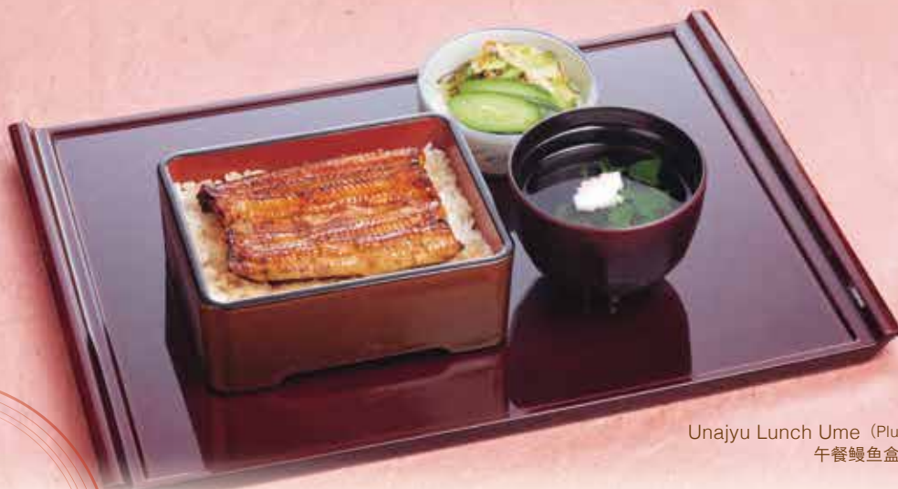
Unajyu Lunch Ume (Plum: Small) 午餐鳗鱼盒饭 梅(小)