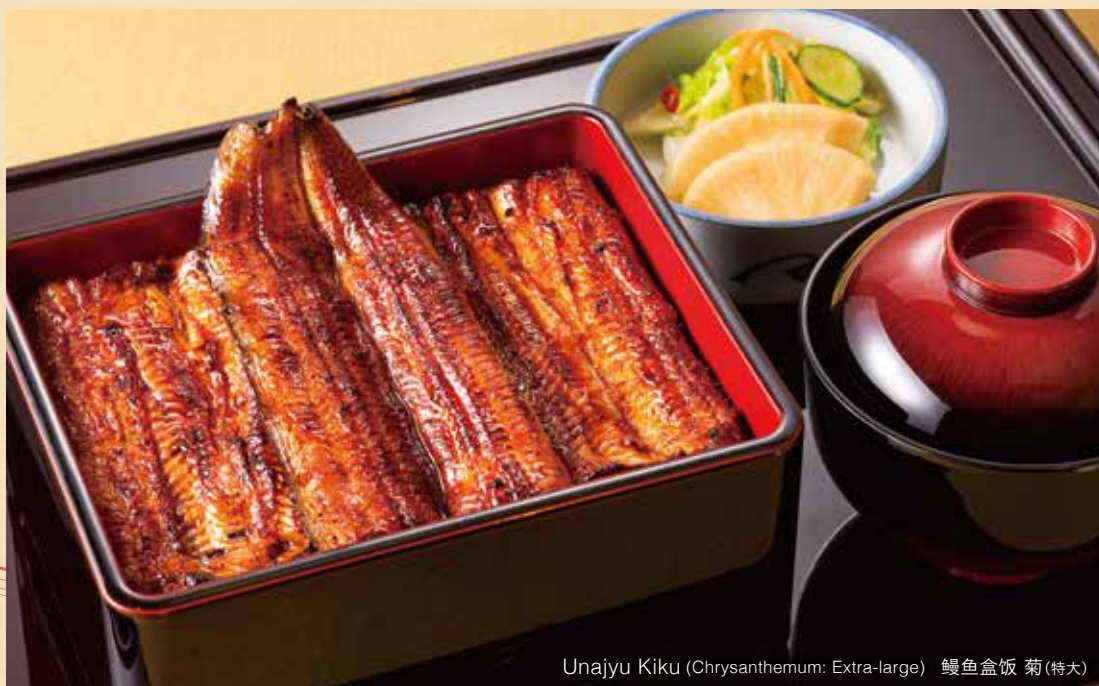
Unajyu Kiku (Chrysanthemum: Extra-large) 鳗鱼盒饭 菊(特大)